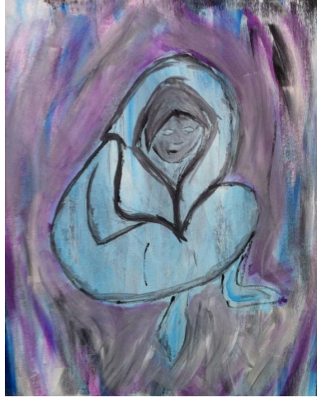
Title of painting: Orphan